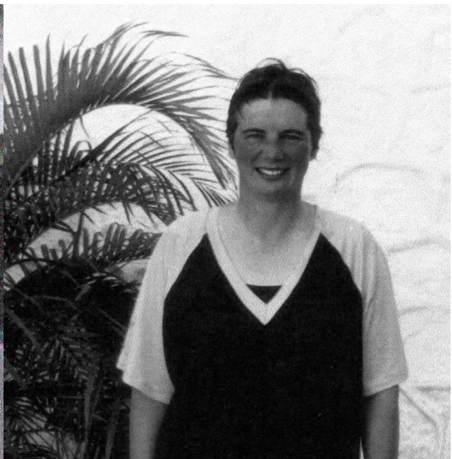
and in 2002