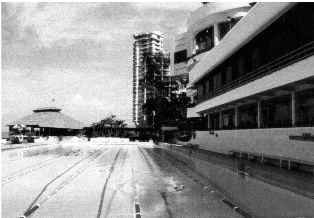
Penang Swimming Club 2002